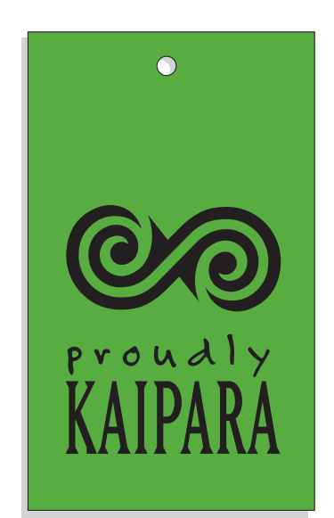
Black on White or a Kaipara District coloured background